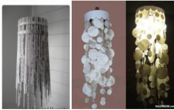
Newspaper Pendant Lamp

Method- Paste news paper pipe on surrounding of any waste cardboard box. It could be box, cane or any ring adjust “0” watt bulb with holder to make it hanging lamp shade or chandelier.